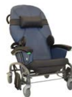
Dyn-Ergo Scoot Chair