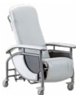
Harmony Care Recliner