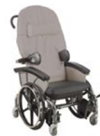
Evolution Mobility Chair