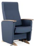
Thera-Glide® Auto Locking Glider