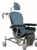
Composition Positioning Chair