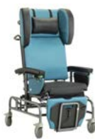
Optimum Positioning Chair