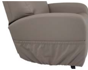
Side Pocket (right, left or both sides)