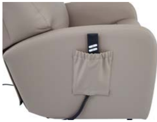
Hand Control Holster